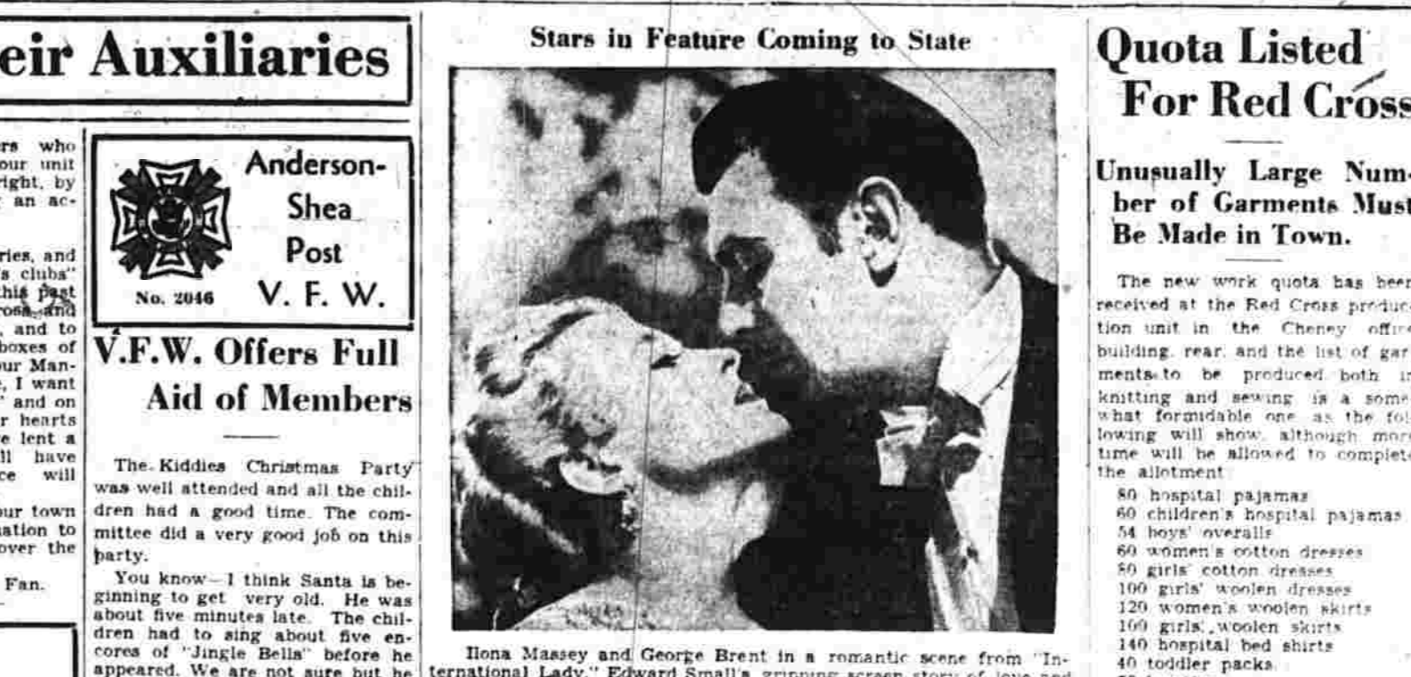
Stars in Feature Coming to State

Sparranburg, S. C.—Sparranburg water wagon caught fire while making its early morning round. The fire department extinguished the fire with more water.